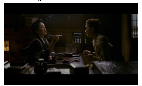
Fig. 7 Mameha conversing with Mother

Alterations have also been made in the conversation that she has Mother. Movie portrays Mameha trying hard to convince Mother to send Chiyo to school again and offers to take her as her younger sister.