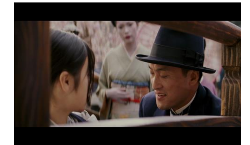
Fig. 3 Chiyo's first encounter with the Chairman

The novel narrates, "in that brief encounter with the Chairman, I had changed from a lost girl facing a lifetime of emptiness to a girl with a purpose in her life" (125). This is beautifully depicted in the film.