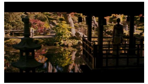
Fig. 14 Sayuri expecting Nobu

But at times individual settings have been altered. This could be to gratify the interests of the audience. This is more potent in the final scene. Novel describes a miserable Sayuri expecting Nobu in a little room at the top of the Ichiriki teahouse. But to Sayuri's surprise the Chairman makes an appearance and she narrates, "...the Chairman was seating himself in the very cushion where I'd expected Nobu to sit" (471). But in the film a gloomy Sayuri awaits Nobu in a beautiful garden overlooking a little stream and there she meets the Chairman instead.