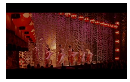
Fig. 13 The traditional Spring Dance

But at times individual settings have been altered. This could be to gratify the interests of the audience. This is more potent in the final scene. Novel describes a miserable Sayuri expecting Nobu in a little room at the top of the Ichiriki teahouse. But to Sayuri's surprise the Chairman makes an appearance and she narrates, "...the Chairman was seating himself in the very cushion where I'd expected Nobu to sit" (471). But in the film a gloomy Sayuri awaits Nobu in a beautiful garden overlooking a little stream and there she meets the Chairman instead.