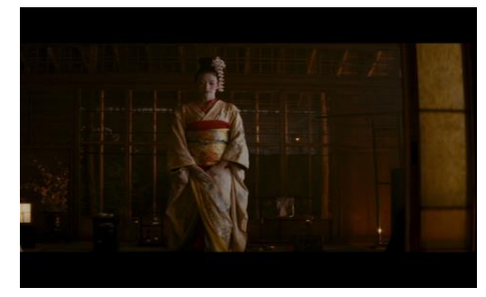
Fig. 8 Chiyo training to become a geisha