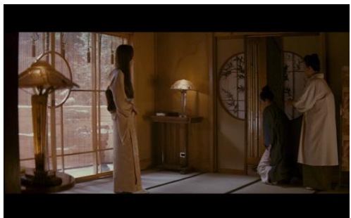
Fig. 12 Mameha's apartment