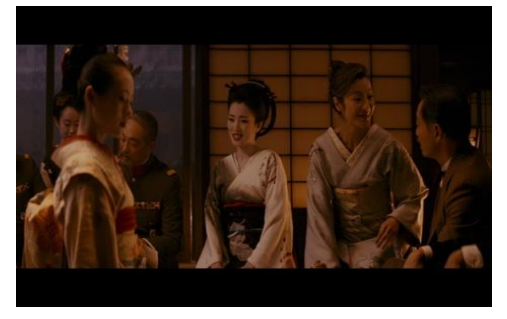
Fig. 11 A teahouse where geisha entertained